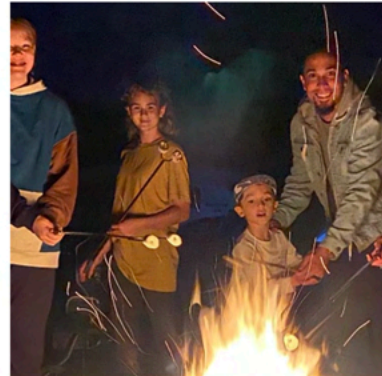
FRIENDS BY THE FIRE AT SUKKOT