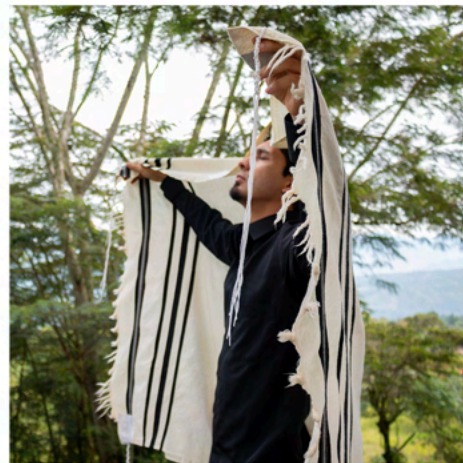
WORSHIP IS POWERFUL DURING PENTECOST