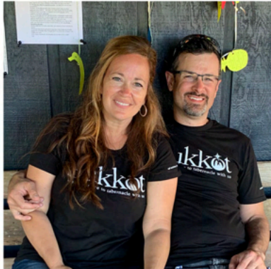
FAMILY TIME AT SUKKOT

As with all the feast days given to all His people, each one reminds us that He alone sustains, He alone preserves, He alone redeems. It is time for us to enter into the fullness of the covenant and be willing and able participants in these seven feast days! By doing so, our lives will not only be enriched by the fullness of what He has done and will do – but we will be a greater witness to all those seeking truth!