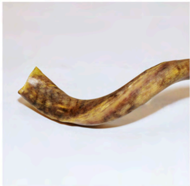
A SHOFAR, TYPICALLY BLOWN ON TRUMPETS