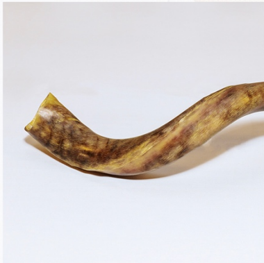
A SHOFAR, TYPICALLY BLOWN ON TRUMPETS