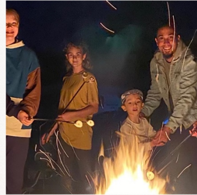
FRIENDS BY THE FIRE AT SUKKOT