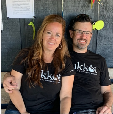
FAMILY TIME AT SUKKOT

As with all the feast days given to all His people, each one reminds us that He alone sustains, He alone preserves, He alone redeems. It is time for us to enter into the fullness of the covenant and be willing and able participants in these seven feast days! By doing so, our lives will not only be enriched by the fullness of what He has done and will do – but we will be a greater witness to all those seeking truth!